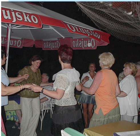
Kolo Women Novi Travnik