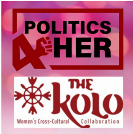
Politics 4 Her